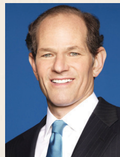
Eliot Spitzer Former Governor of New York